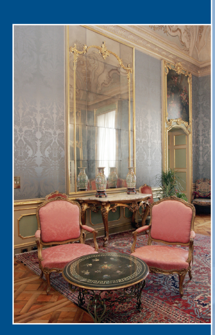
Particolare degli arredi della Sala dei Carron di San Tommaso