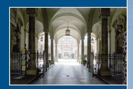
Lo scenografico atrio a quattro campate con antiche colonne marmoree